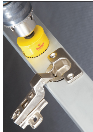
CSC Hole Saw application.