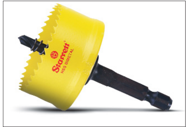
Bi-Metal Cordless Smooth Cut Hole Saws.