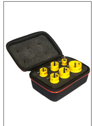
CSC Hole Saw Kits also available see pg 54.