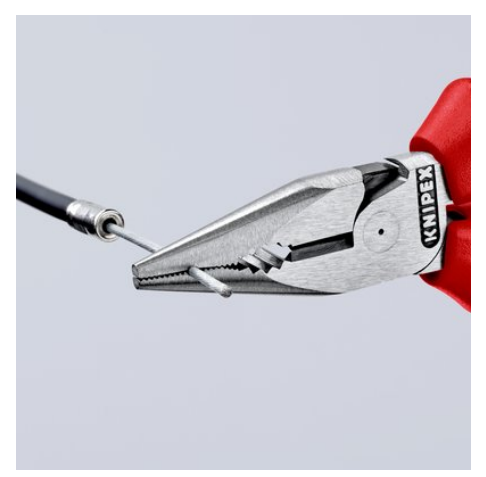
Milled groove in the gripping area