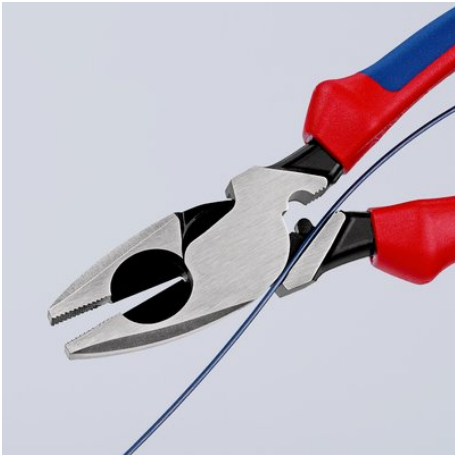
09 11/12 240: fish tape puller in the joint gap