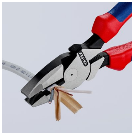
Long cutting edges for cutting flat cables