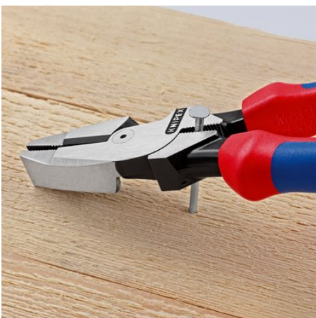
Gripping zone below the joint for powerful leverage