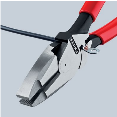
09 11/12 240: universal mandrel crimping area below the joint