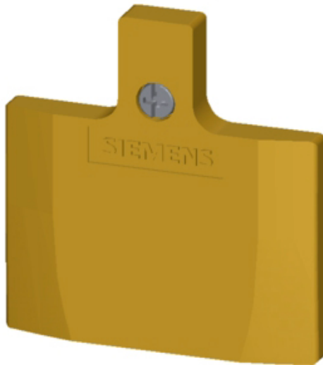
COVER FOR POSITION SWITCH FOR PLASTIC HOUSING 50MM, COLOR YELLOW