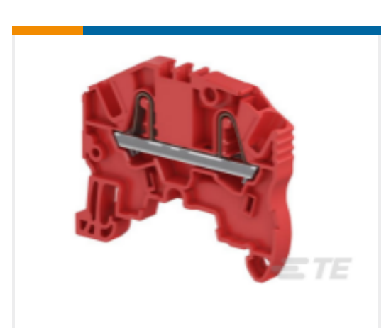
TE Model / Part #1SNK705062R0000 ZK2.5-RD