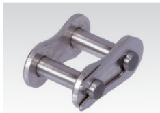
No. 11/E: Connecting link with spring clip