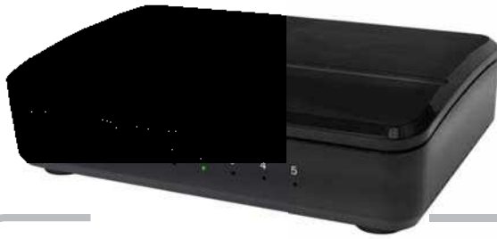
Art No. NS0105