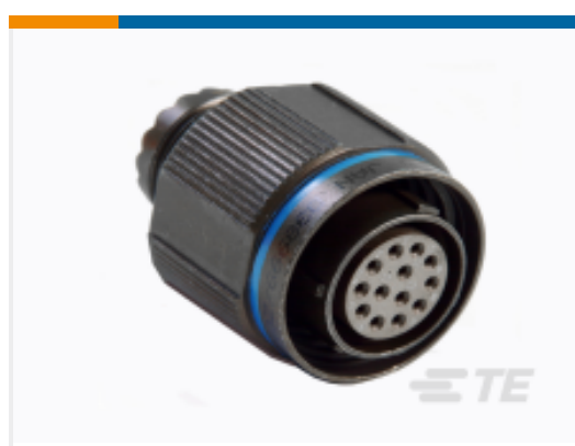
TE Part #YDTS26W25-29PNV001 D38999: Straight Plug, 25-29 Insert