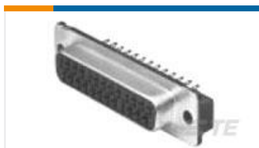
TE Part #5747713-2 37 RCPT ACT PIN/MS MED STD