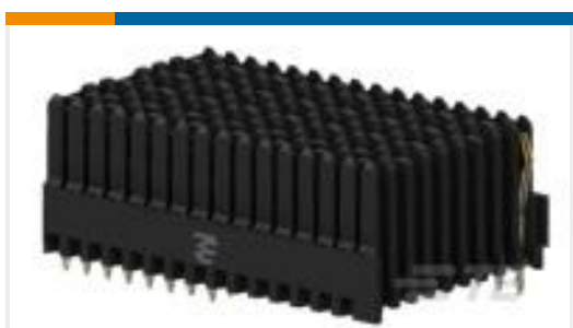
TE Part #1410966-1 MULTIGIG RT T2 .8" BP FULL CNTR RTM SEL