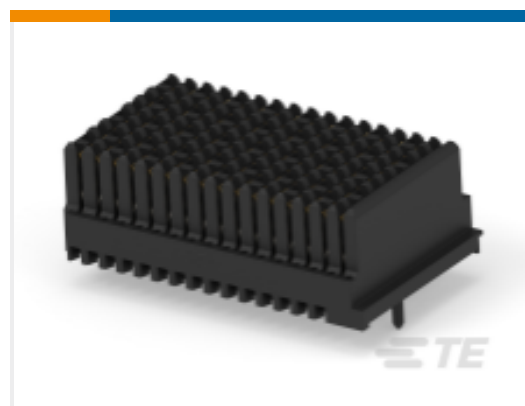
TE Part #2364030-1 VERTRECCASSY,RIGHTEND,MULTIGIG RT3(Sn/Pb)