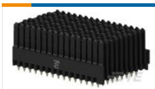
TE Part #1410964-1 MULTIGIG RT T2 .8" BP FULL CNT