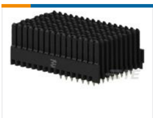
TE Part #1410965-1 MULTIGIG RT T2 .8" BP FULL CNT