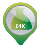
PS210 (SS1441E only)