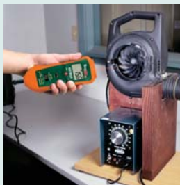
Non-contact model for use on machinery where high speed measurements are required