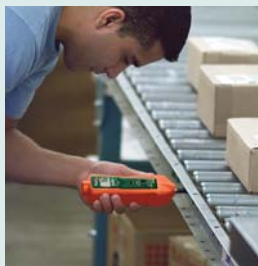
Accessory wheels enable tachometer to measure linear surface speeds