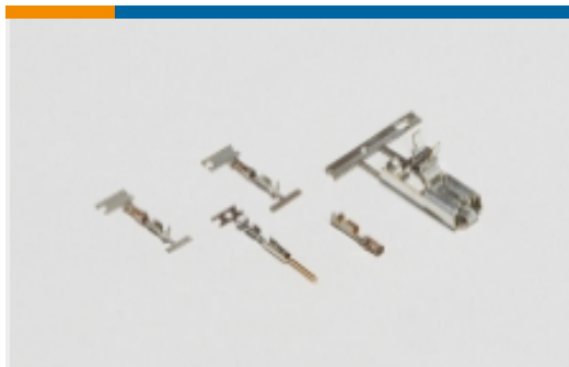
Wire-to-Board Connector Contacts(6)