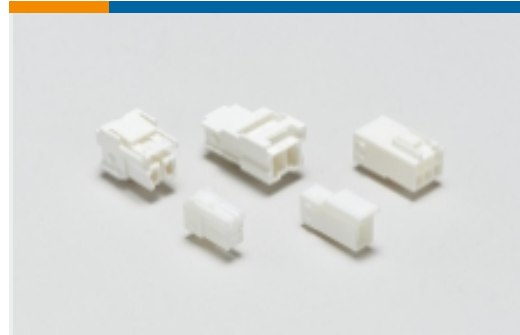
Rectangular Power Connectors(43)