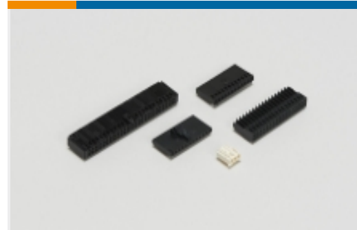
Wire-to-Board Connector Assemblies & Housings(216)