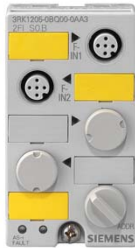
SAFE MODULE K45F, WITH TWO SECURE INPUTS 2FE