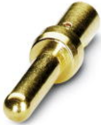
Crimp contact, turned, Single contact, contact diameter: 1 mm, crimp range: 0.08 mm 2 ... 0.22 mm 2

Please be informed that the data shown in this PDF Document is generated from our Online Catalog. Please find the complete data in the user's documentation. Our General Terms of Use for Downloads are valid ( http://phoenixcontact.com/download )