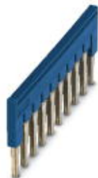
Plug-in bridge, Pitch: 6.2 mm, Number of positions: 10, Color: blue

Please be informed that the data shown in this PDF Document is generated from our Online Catalog. Please find the complete data in the user's documentation. Our General Terms of Use for Downloads are valid ( http://phoenixcontact.com/download )