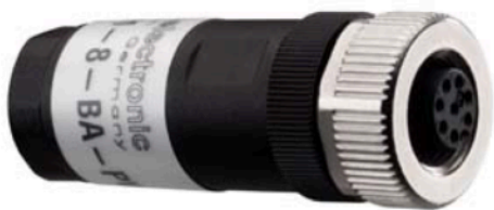
Part no.: 50110649 KD 01-8-BA-PWR Adapter