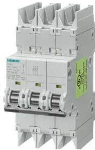
CIRCUIT BREAKER 10KA, 3POLE, D, 15A ACC. TO UL 489 - 480Y/277V