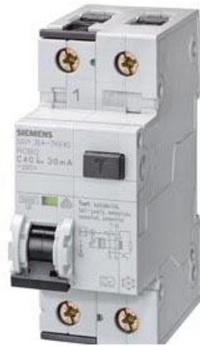
FI/LS-PROTECTOR TYPE A (PSE/SSF), D=70MM IFN 300MA,10KA, 1+N-POLEE B 25A