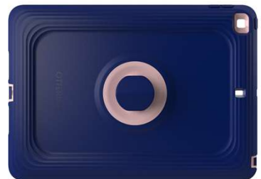
SPACE EXPLORER 77-83272 840104262924