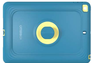
GALAXY RUNNER 77-83271 840104262917