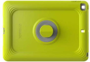
MARTIAN 77-83270 840104262900

Mobile gadgets for younger tech users need kid-specific protection. When teaching kids responsibility and exhibiting trust, we give them tablets and phones. Kids are kids and no matter how careful they want to be, accidents happen, plus, kids are just different than your average tech user. Ensure kids' tech is ready for anything with OtterBox Kids EasyGrab Tablet Case for iPad. Known for legendary protection, OtterBox designed EasyGrab Tablet Case especially for small hands. Made to prevail over tumbles. The case is designed for easy and frequent cleaning and sanitization. Included with EasyGrab Tablet Case is the innovative EasyGrab Multi-Use Case Stand designed for secure car travel, multiple hands-free viewing angles and convenient carrying on the go. Help kids grow their minds, grow their confidence and make the most of their iPads with OtterBox Kids EasyGrab Tablet Case. We've developed a 360° design approach just for kids. OtterBox Kids EasyGrab Tablet Case, OtterBox Kids Power and Audio Connector Cables and OtterBox Kids Blue Light Guard Glass Screen Protector work together seamlessly giving your kids an unprecedented set of tools designed specifically for how they stay connected. Give your kids independence and enhance their tablet experience with OtterBox Kids accessories.