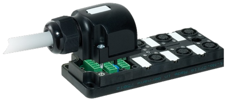
M12 Females 5-pole