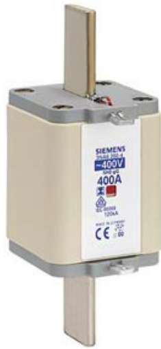
LV HRC FUSE LINK GL/GG WITH INSULATED GRIP LUGS WITH COMBINATION INDICATOR SIZE 2, 400A, AC 400V