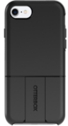
Black 77-54090 (ProPack) 660543403838