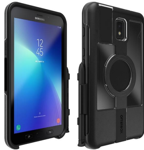
Black/Clear 77-61002 660543486879