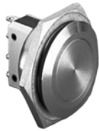
MP0038 Sealed to IP66