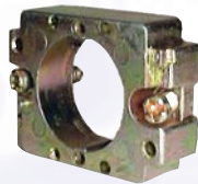
Front mounting collar RAS-FB