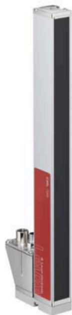
Figure can vary

Part no.: 50119275 CML730i-R20-1750.R/CV-M12 Light curtain receiver