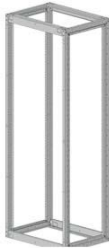
SIVACON SICUBE FRAME_GALVANIZED_2,5MM HEIGHT 2000 WIDTH 600 DEPTH 400