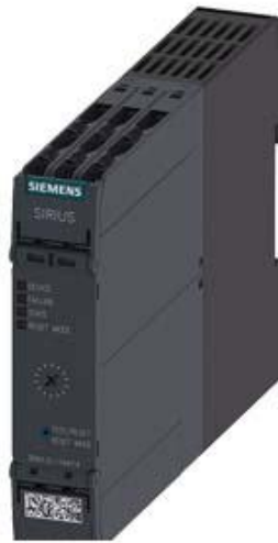
MOTOR STARTER SIRIUS 3RM1 REVERSING STARTER 500 V; 1,6-7,0 A; 110-230 V AC SCREW CONNECTION SYSTEM