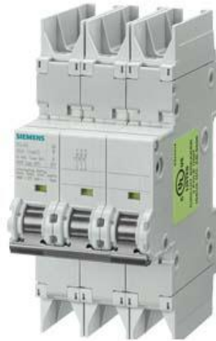
CIRCUIT BREAKER 10KA, 3POLE, C, 16A ACC. TO UL 489 - 480Y/277V