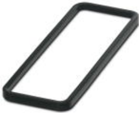
Profile gasket for HEAVYCON EVO supporting base element type B24

Please be informed that the data shown in this PDF Document is generated from our Online Catalog. Please find the complete data in the user's documentation. Our General Terms of Use for Downloads are valid ( http://phoenixcontact.com/download )