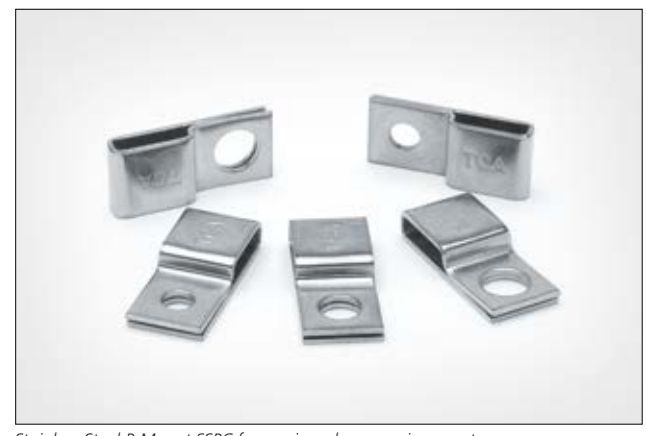
Stainless Steel P-Mount SSPC for use in arduous environments.