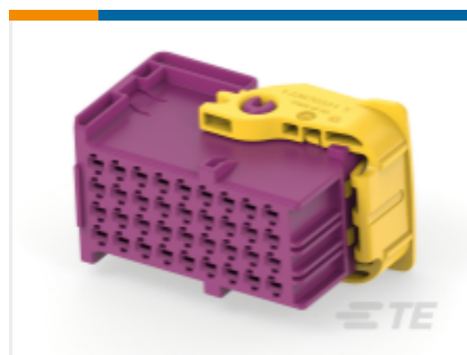
TE Part # 2377780-2 36POS,AMP MCP 1.5K,REC HSG ASSY, UNSLD