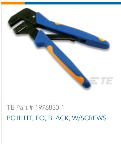
TE Part # 1976850-1 PC III HT, FO, BLACK, W/SCREWS