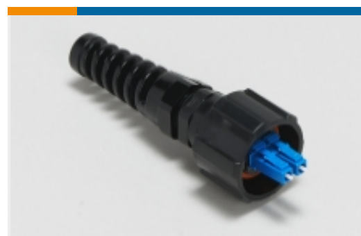
ODVA LC Connectors(3)