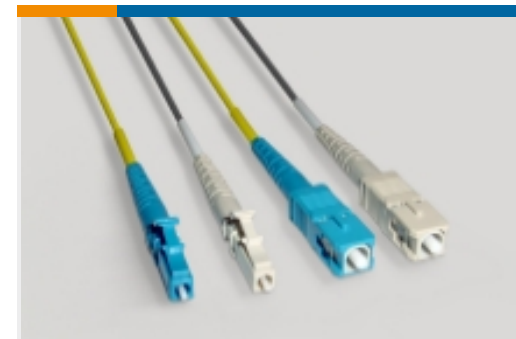
Fiber Optic Patch Cable Assemblies(8)