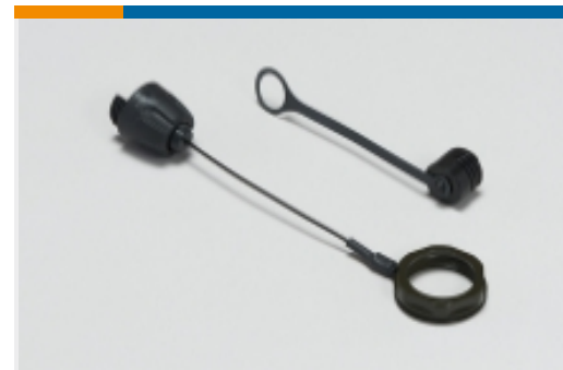
Fiber Connector Covers & Caps(1)