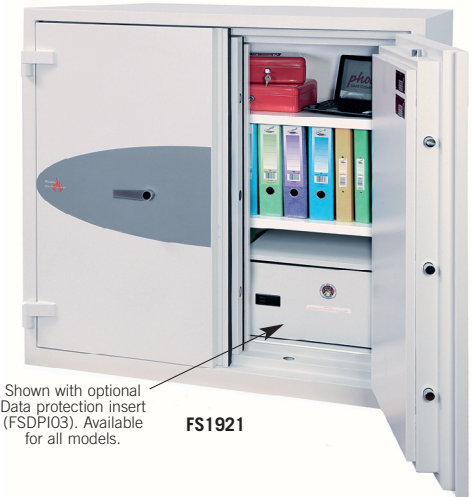
Shown with optional Data protection insert (FSDPI03). Available for all models.