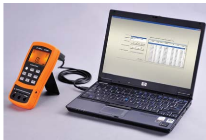
Figure 1: Automate the recording of continuous readings when you hook the U1701A/U1701B to a PC

The handheld capacitance meter comes in a robust overmold and tested to stringent industrial standards. Each capacitance meter is also sealed with a three-year warranty and the assurance that you can test your components with confidence.