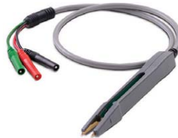
U1782A SMD tweezer