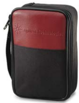
U1174A Soft carrying case