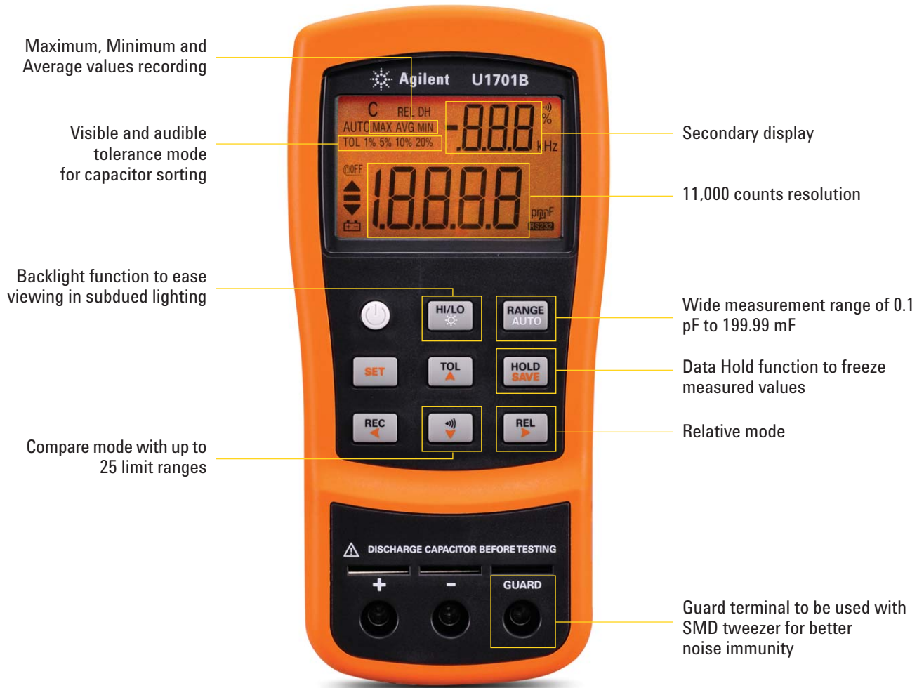
Figure 2: U1701B front view