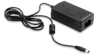
U1780A Power adapter and cord (according to country)