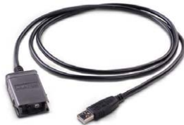
U5481A IR-to-USB cable