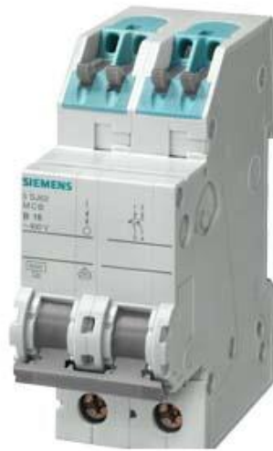
CIRCUIT BREAKER 400V 6KA, 2-POLE, C, 16A, D=70MM WITH SCREWLESS TAP-OFF TERMINAL