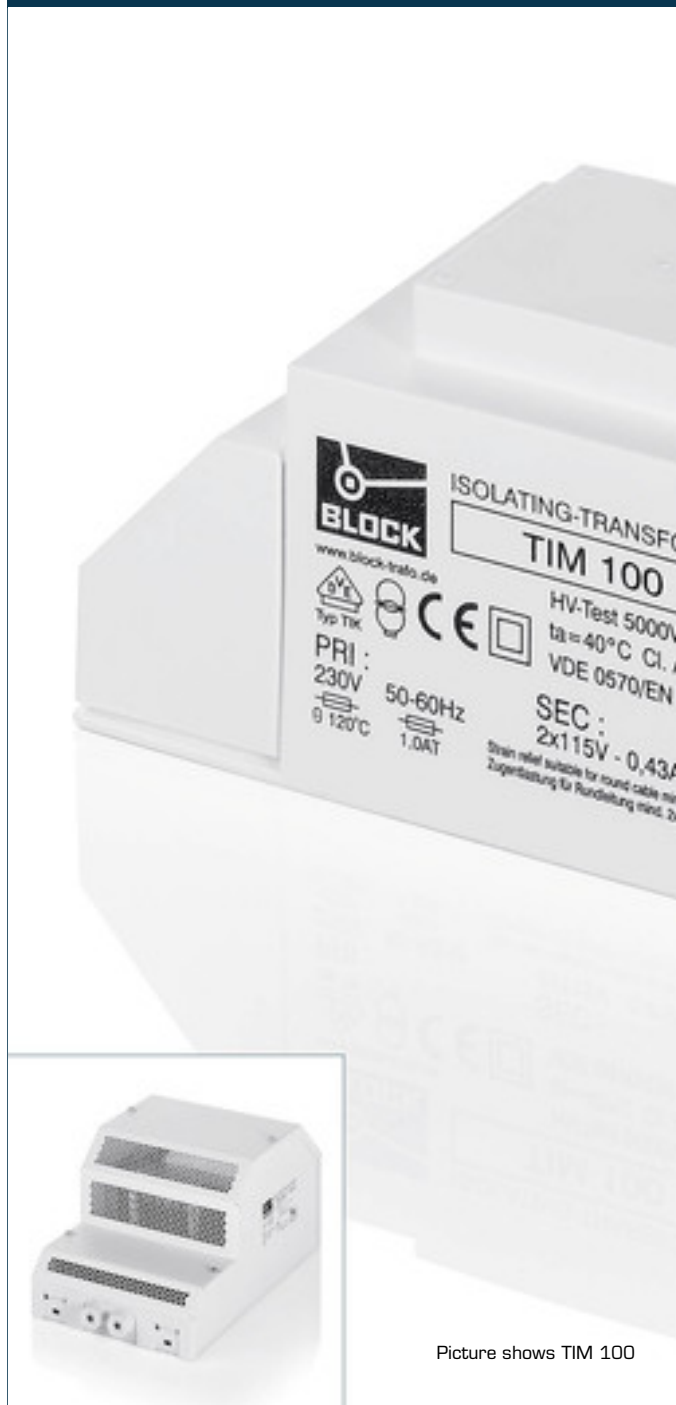
Picture shows TIM 100