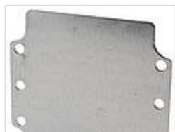
Mounting panels for PK 105 - 115, galvanised sheet steel