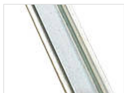
DIN rails for PK 105 - 115, DIN EN 60715 TH 15