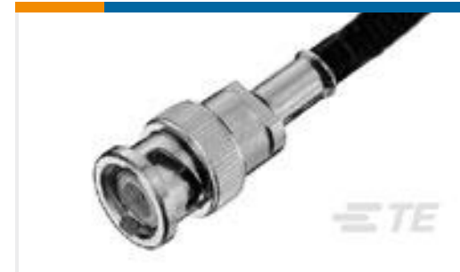
TE Part #5330876 BNC PLUG