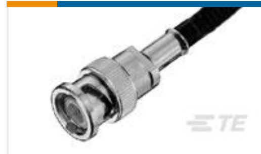
TE Part #2-5329446-1 BNC PLUG KIT