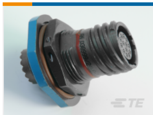
TE Part #YDTS24W13-08SNV001 RECP ASSY