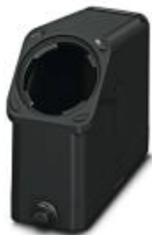
HEAVYCON EVO sleeve housing, plastic, with bayonet flange for EVO screw connection, B24, for single locking latch, height: 87.5 mm, without EVO screw connection

Please be informed that the data shown in this PDF Document is generated from our Online Catalog. Please find the complete data in the user's documentation. Our General Terms of Use for Downloads are valid ( http://phoenixcontact.com/download )