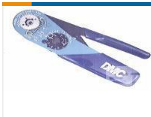
TE Part # 601966-1 CRIMPING TOOL M22520/2-01