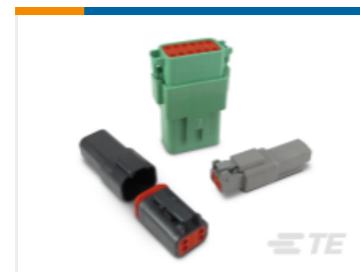
TE Part #DT04-2P DEUTSCH DT Series Housings & Connectors