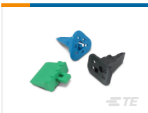
TE Part #W2S DEUTSCH DT WEDGELOCKS