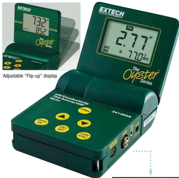
Adjustable “Flip-up” display