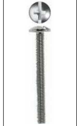
Imagen de producto/ Product picture