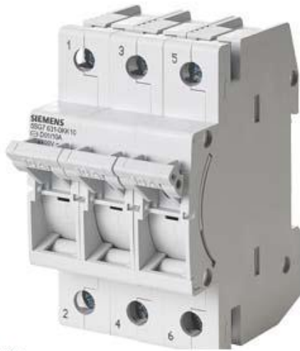
MINIZED-SWITCH-DISCONNECTOR D01 16A 230/400V 1P FOR FUSE-LINKS 2-16A