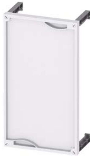
ALPHA 400/630 DIN, KIT SPACE COVER WITH SUPPORT H=450 W=250