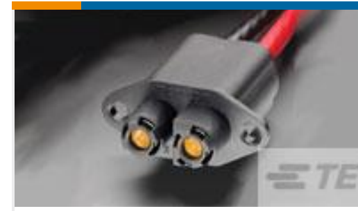
TE Part #5-1609075-1 60DBPL9=F6835B