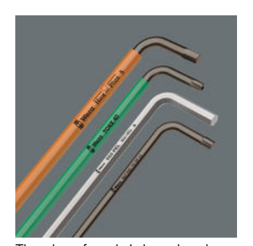
The size of each L-keys has been engraved by a laser. In addition SPKL L-keys have a colour coding according to sizes – for simple and rapid accessing of the required tool. Making it easy to find the right tool.