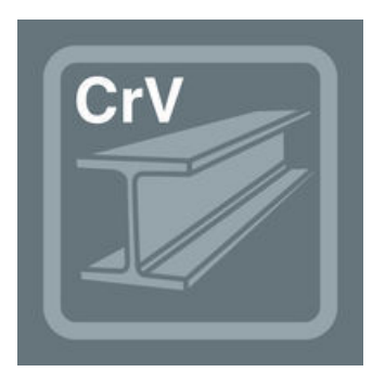
The chrome-vanadium steel version makes the plug-in tools suitable for heavy loads.