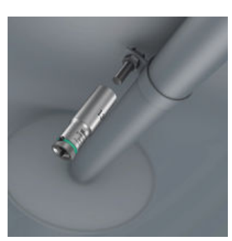
Due to the long design of the socket, screwdriving can also be achieved in small spaces. Fittings with protruding threaded rods are often also possible.