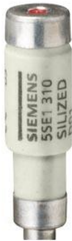
SILIZED FUSE LINK 400 V GR,SEMICOND.PROTECT.GR.D01 16 A