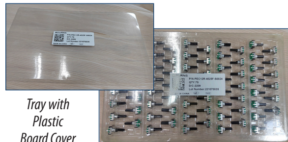
Tray with Plastic Board Cover

There is no change to form, fit, or function of the actual product as this is a packaging change only. Quality and reliability should be improved due to the reduction in air contact and movement of the product within the tray. There is no change to packaging quantities.